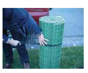
Re-assemble the disassembled floor back into rolls.