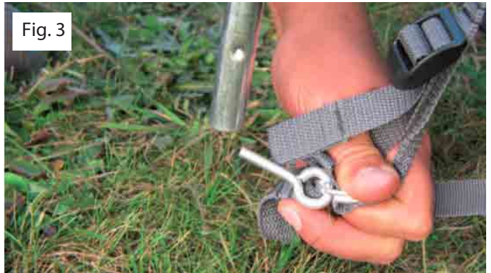
"RING & PIN" SYSTEM FOR EASY SET UP

2 Place one end of the poles down over the metal pin fastened in the ring. (Fig. 3) Go to the opposite end of the pole and apply pressure to the pole forming an arch until you are able to insert the other pole end over the pin. Repeat this with the remaining poles. Clamp the hooks on the tent onto the poles. Repeat this with all poles.