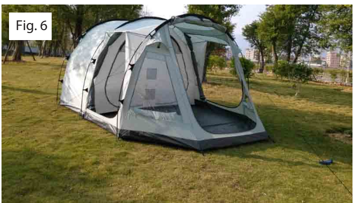
FINALLY SECURE THE TENT AGAINST STRONG WIND

4 Finally secure the tent against strong winds with the preattached guylines and stakes. Use a mallet to secure the stakes. (Fig. 6)