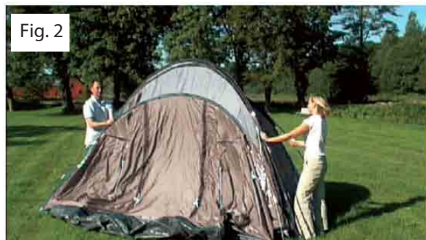
THIS TENT SHOULD BE ERECTED BY AT LEAST 2 PERSONS

2 Place one end of the poles down over the metal pin fastened in the ring. (Fig. 3) Go to the opposite end of the pole and apply pressure to the pole forming an arch until you are able to insert the other pole end over the pin. Repeat this with the remaining poles. Clamp the hooks on the tent onto the poles. Repeat this with all poles.